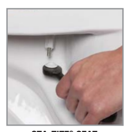
STA-TITE® SEAT FASTENING SYSTEM™