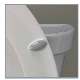
SUPER GRIP BUMPERS™